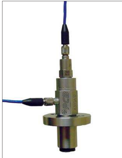
Figure 4. test transducer, reference transducer, and anvil mounting arrangement.