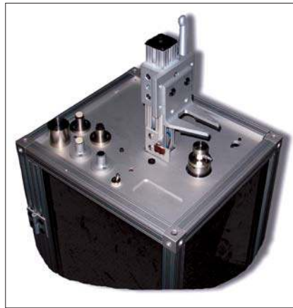
Figure 3. 9155C-525 pneumatic shock exciter.

The authors can be contacted at: calibration@modalshop.com . Please visit: www.pcb.com for more information on this and other PCB products.