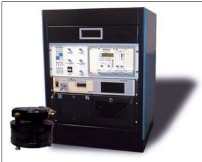
Figure 1. Accelerometer calibration workstation next to an electrodynamic air bearing calibration shaker. 1